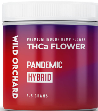
THCA FLOWER PANDEMIC

RPD: Relative Percent Difference between unknown sample and its duplicate LCS: Laboratory Control Sample with known concentration Case Comments: There were no divergences from ordinary Quality Control procedures or SOPs.